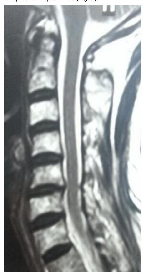
Figure 1: Magnetic Resonance Imaging T2 sequence of cervical spine, showed compression of spinal cord at C 5-6 level

Nucleus pulposus of the disc would come out through the wall of the disc, filled the spinal canal and compress the spinal cord (Fig. 1).