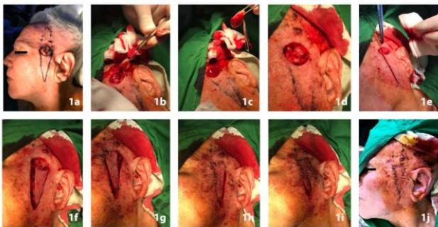
Figure 1: a - Clinical manifestation of a tumour, prior the surgical excision; b, c, d, e - Intraoperative finding. Oval shaped excision of a tumour with the preparation of the island flap; f - Postoperative findings. The surgical wound is closed with single stitches

An 83-year-old, fair-skinned, blue-eyed Caucasian male patient was admitted for a second time in the clinic for dermatologic surgery, with a medical history of multiple non-melanoma skin cancers in the past couple of years. The occasion of the certain hospitalisation was a recently occurred tumour formation, located on his left infratemporal area. Clinical examination revealed a nodular formation, with the ulcerated surface, covered with yellowish crusts and raised pearl-like edges, affecting the skin of the left preauricular, infratemporal area (Fig. 1a).