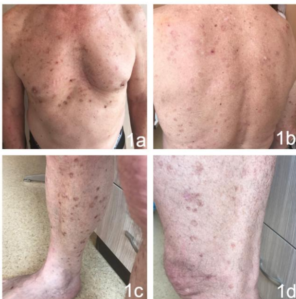
Figure 1: a, b – Clinical presentation of disseminated porokeratosis on chest and back in 74-year-old male patient; c, d – Clinical presentation of disseminated porokeratosis on lower legs, with closer view of cornoid lamella

A 74 – year - old male patient presented with 2 - months history of erythematous rash on the lower legs, accompanied by itching. The clinical examination revealed multiple individual erythematous, slightly atrophic macules and papules, with brownish discoloration, surrounded by peripheral keratotic ridge, resembling cornoid lamella, disseminated on the chest, back and lower extremities (Fig. 1 a, b, c, d).