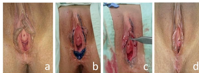
Figure 1: a) Labia minora hypertrophy II-A-A (Gonzalez Classification); b) Pre-surgery markings; c) Immediate post-surgery; Right side DP mode; Left side SP mode; d) 2-month post-surgery

Outcomes were analyzed with validated tools: Vulvovaginal Symptom Questionnaire (VSQ) and Visual Analog Scale (VAS) before and at least one month after CO 2 Laser labiaplasty. An image report has been carried out (Fig. 1).