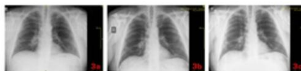
Figure 3: a, b, c - Chest radiography detected bilateral hilar enlargement with irregular borders, which can be associated with hilar lymphadenopathy. An infiltrate with perihilar paracardial localisation cannot be excluded. Horizontal linear opacities between the medium and the lower lobes of the right lung were also observed

Chest radiography detected bilateral hilar enlargement with irregular borders, consistent with hilar lymphadenopathy (Fig. 2). An infiltrate with perihilar paracardial localisation could not be excluded. Horizontal linear opacities between the medium and lower lobes of the right lung were also reported (Fig. 3).