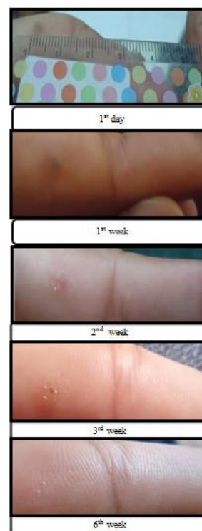
Figure 2: Treatment with 80% phenol solution

Chi-square test and Fisher exact test with a level of significance 0.05 were utilised to test the significance of the difference of cure rate between electrodesiccation with curettage and application of 80% phenol solution.