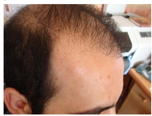
Figure 4: Our patient five months later the third hair transplant

A control five month after the third surgery, showed excellent results regarding hair density (Fig. 4).