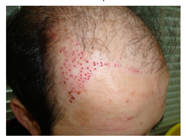
Figure 1: Extraction of follicles with punches

A 26-year-old man presented to our hair transplant clinic for consultation. The patient had undergone hair transplantation two years prior, for type-seven androgenetic alopecia. He was not satisfied with the results of his transplantation; he was particularly dissatisfied with his transplanted hairline. The patient was originally referred to our clinic for laser hair removal of the transplant.