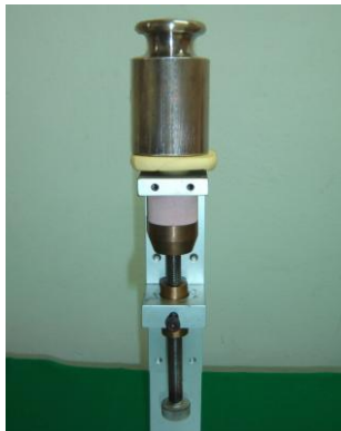
Figure 2: Load application during bonding

Specimens were allowed to set under a constant load of 1 kg for 15 minutes using a polyvinylsiloxane (Express putty, 3M ESPE, St. Paul, MN, USA) putty mould that was placed over the brass split mould and held in place by the weight (Figure 2). The 1 kg load was removed, and the samples were allowed to sit at room temperature for an additional 30 minutes with the polyvinylsiloxane mould still in place.