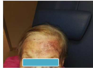
Figure 3: Patient after radiation treatment

of 6MV and a total dose of 40 Gy during 10 fractions. The patient achieved a full-scale remission of the lesions. There was no tumour recurrence in the monitoring period of 3 months.