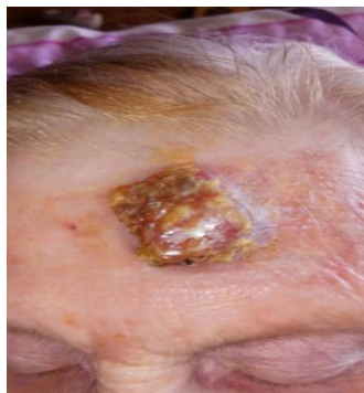
Figure 2: Patient before treatment

The performed CT examination indicated no presence of other tumour formations in the deep tissues of the head and the neck. The finding was normal.