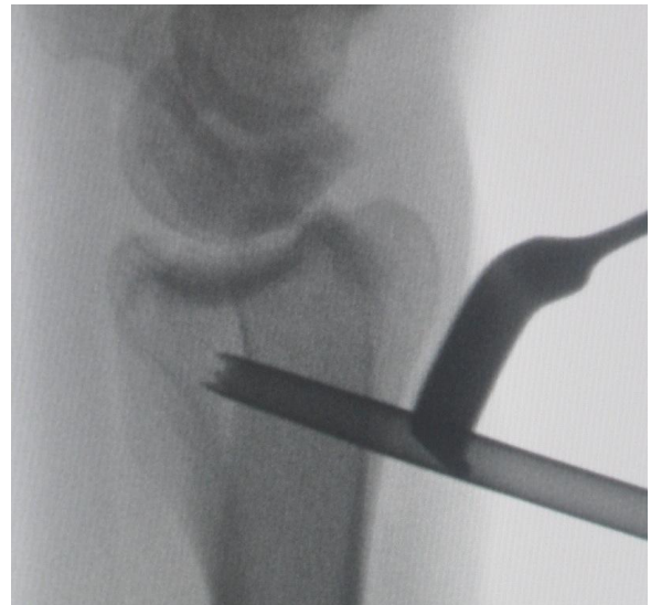
Figure 4: Harvesting of distal radius bone graft under fluoroscopic guidance

We used XLSTAT (Addinsoft, USA) for all statistical tests. Non-parametric tests were used for our results. The chi-squared test was used for categorical variables, and the Wilcoxon Rank test was used for continuous variables.