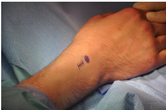
Figure 2: Eight mm incision over listers tubercle

Initial treatment involved a below elbow plaster or splint immobilisation of at least 6 weeks. Patients who failed to show progression towards union after an initial period of non - operative treatment were then considered for a further conservative measure or operative treatment. In conjunction with patient consultation, a decision was then made to proceed with operative intervention with our described technique. Patients were followed up using clinical and radiological examination either with radiographs or 3 - dimensional reconstruction such as CT or MRI. After surgery, the patient was immobilised in plaster for 6 weeks. At 6 weeks they were followed up with scaphoid series radiographs and clinical examinations while being allowed to mobilise.