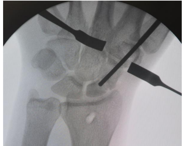
Figure 7: Graft packed into scaphoid using pusher

there is no change in the shape of the scaphoid with the introduction of the graft.