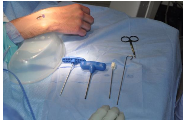
Figure 3: Jamshidi needle and tracer set

Outcomes were assessed as time to radiological union, or salvage procedure of excision distal pole and using preoperative and postoperative DASH score.