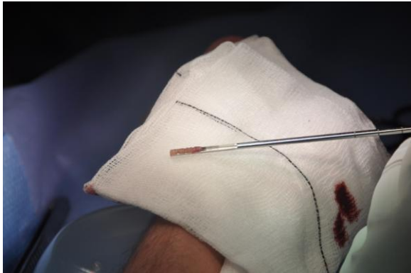
Figure 5: Distal radius bone graft harvest

then the scaphoid is drilled using the 'Standard' Acutrak drill bit. The authors prefer to carry out all drilling on hand power which allows for much more controlled scaphoid excavation. A dorsal incision of 5mm based just proximal to Lister's tubercle is made, and a bare area of bone is identified (Figure 2).