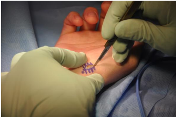
Figure 1: Eight mm incision at distal pole of scaphoid

benefits of performing surgery. Most patients who consented to surgery were young, self - employed males. Four shot - scaphoid radiographs were taken preoperatively and then classified according to the Filan and Herbert classification into either D1 - fibrous union or D2 - pseudoarthrosis.