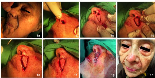
Figure 1: The lesion was removed in the form of the letter O, with a comparatively small field of surgical security of 0.3 cm in all directions. Then contouring of a triangle in the distal direction from the nose was performed, and the contours were gradually prepared to the musculature in depth (1c-d). This was followed by a transposition of the already prepared triangle to the ala nasi and a careful adaptation of the wound edges (1e-g)

An 82-year-old woman is presented, with height 156 cm and weight 49 kg, in a good overall condition. There is no evidence of family history, concomitant diseases and medication. The patient was first admitted to the clinic for surgical removal of a neoplasm that occurred approximately 2 years before, which gradually began to increase in the last few months. During the dermatological examination, we found a nodular formation on the left side of the nose, at the border with the nasolabial fold. The lesion had a rigid consistency, nodular, without a pearl edge, located immediately below the nasolabial fold, but at the same time involving the ala nasi on the left (Figure 1a).