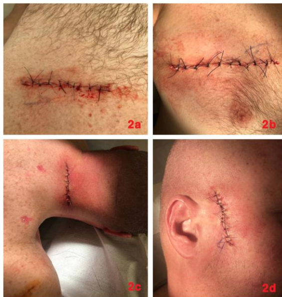
Figure 2: a-d) Clinical status postoperatively

Seven of the lesions were removed by elliptical excision with a field of operational security of 0.5 cm in all directions (Figure 2a-d). The histological examination showed a mixed histological picture: three multicentric BCCs with clean resection lines and four solid BCCs with free resection lines.