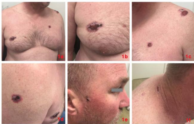
Figure 1: a-f) Multiple BCC with relative similar clinical appearance. Clinical observation during the first medical examination

1a-f) while on the back were set erythema plaques covered with crusty exudate (Figure 2c).