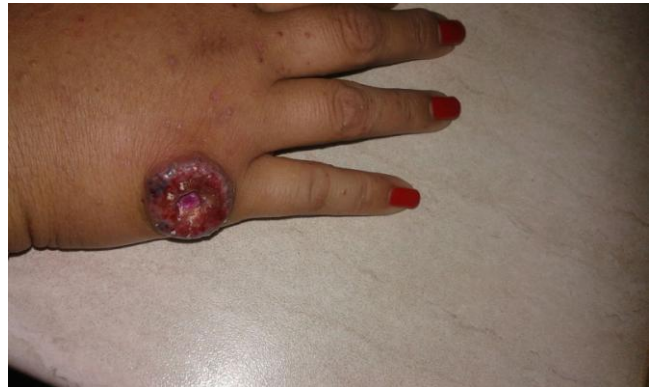
Figure 3: Pyoderma gangrenosum. An area of ulceration with violaceous borders and surrounding erythema

In 2017, the patient developed on the right hand an area of painful, rapidly enlarging, ulceration (Figure 3). Clinical examination showed a 2.5 cm diameter-ulceration with violaceous borders and surrounding erythema. Similar lesions were also present on the lower extremities.