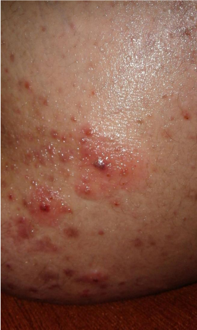
Figure 1: Subcorneal pustular dermatosis. Small flaccid pustules varying in size from 0.5-2 cm that tended to coalesce to form annular or circinate pattern

eosinophils (Figure 2). Direct immunofluorescence was negative.