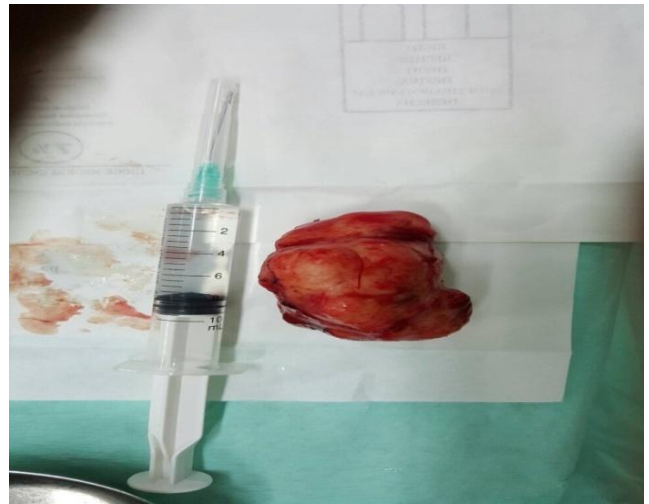
Figure 3: The tumor size 6 x 4 x 3 cm

were also showed no abnormalities. Then we performed computed tomography of the neck for this patient, and the result showed soft tissue tumour with the size of 6.63 x 4.21cm in the left submandibular.