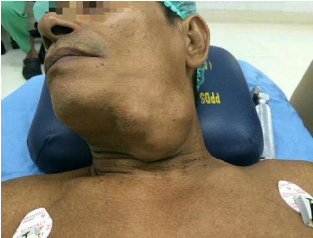
Figure 1: Anteroposterior view of the neck mass

A patient, 53 years old man referred from Haji General Hospital to the outpatient clinic of Adam Malik General Hospital with the main complain of swelling on the left neck for the last 20 years prior admission. The mass was enlarging slowly. He denied any pain, nasal blocking, headache, diplopia, hoarseness, dysphagia or odynophagia, no history of bleeding and mucous secret.