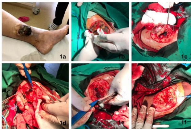
Figure 1: a) Primary cutaneous giant melanoma in a schizophrenic patient; b-f) Surgical excision of the primary tumor under general anaesthesia. A split skin mesh graft was planned after 3 weeks

approximately 26 years ago. Last, about 2 years ago, she received the antipsychotic drug Olanzapine 5mg for 3-4 months. The patient is now receiving Biperiden Hydrochloride 2 mg (1-1-0) and Aripiprazole (antipsychotic) 15 mg (0-0-1) therapy. Her therapy is currently discontinued for schizophrenia. The patient reports the presence of a pigmented lesion on the medial surface of the left lower leg for approximately 10 years. About 6 months ago she noticed the occurrence of nodules on the medial surface of her left lower leg, and subsequently, the pigment lesion progressively increased its size (Figure 1a).