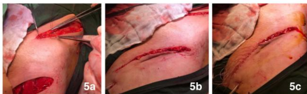
Figure 5: a-c) Defects closure with single cutaneous surgical stitches

between the intake of antipsychotics and the possibility of subsequent melanoma formation [3]. Already in 1982, an antitumor effect of dopamine antagonists on the development of melanoma was discussed [3]. Melanoma culture research in mice then showed that the antidopaminergic agent (Pimozide) used had an inhibitory effect on mouse melanoma cells [3]. Similarly to other authors, we maintain that schizophrenic patients receiving anti-dopamine therapy show a lower incidence of melanoma [6].