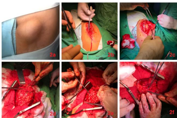
Figure 2: a-f) Inguinal lymph node dissection was carried out

Subjectively there is a complaint about itching. Approximately 4 months ago, the patient consulted a surgeon for that lesion and was referred for surgical removal of the formation. However, the patient refuses to undergo surgery and is conservatively treated with Povidone-iodine ointment and herbs. A subsequent significant increase in the size of the lesion was observed, which is the reason for hospitalisation. Dermatological examination revealed the presence of an exophytic, tumour-like formation with an erosive surface, in decay, releasing stenching smell, located on the medial surface of the left lower leg (Figure 1a).