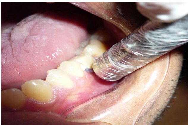
Figure 2: A photograph showing laser application at the implant site

A 904 nm Gallium-Arsenide diode laser device (OPTODAN, Saratovskaja provinces, Saratov, Russia) was used in the present study. Implant site in the laser group was irradiated using contact mode, continuous wave, 20 mW output power, spot diameter 4mm and exposure time 30 sec [20] with a dose 4.7 J/cm 2 [21].