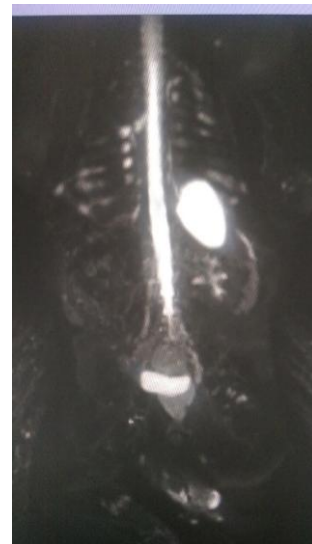
Figure 3: Magnetic resonance- magnetic urography in the early phase of renal and inferior vena cava thrombosis

Afterwards, the boy has been attending the outpatient clinic. Anticoagulant therapy continued with subcutaneous low molecular mass heparin (LMWH) for three months and subsequently discontinued when the coagulation profile was normal. Despite anticoagulant therapy, the right kidney developed areas of scarring and then atrophy. Kidney volumes after 4 months of treatment showed right kidney 34 x 20 mm and left kidney measuring 68 x 35 mm). His follow-up laboratory results showed normal kidney function. At the age of 8 months, DMSA scan showed no renal tissue on the right side, as a consequence of renal atrophy.