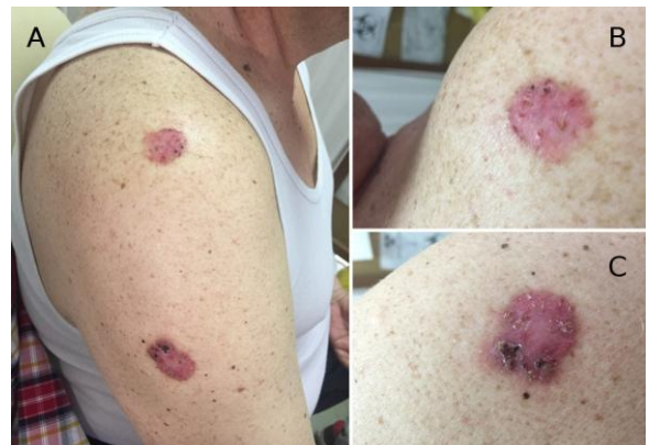
Figure 2: a), b) and c) Two nummular lesions (Fig. 2 b upper lesion, Fig. 2 c lower lesion) in the right brachial region, presenting as erythematous papules with sharp margins from the surrounding skin, gritty desquamation and dotted hyperpigmentations inside the lesion

When asked, the patient reported that he detected them several years ago and recorded discreet bleeding with mechanical trauma and crust formation over time, but the changes were also neglected, and he did not report them to a doctor before. A dermoscopy was initiated, which supported the initial suspicion of a cancer lesion.