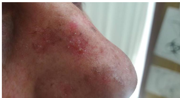
Figure 4: Nasal actinic keratosis lesion

Furthermore, an actinic keratosis lesion in the nasal region was to be noted, which was dermoscopically verified. The treatment of choice was cryotherapy, with a successful outcome.