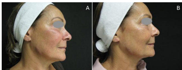
Figure 6: a Typical aspect of a patient with problems related to PMMA injection; (a) Plethoric face, inflammatory aspect, granulomas, deformities and some neovascular formations; (b) Result after intralesional laser treatment on the mandibular border, the malar and zygomatic region

Histological studies were performed in all subjects, focusing on the effects of the laser. The laser produces channels along the fatty tissue and fibrous tissue including the granulomas and the alloplastic filler material (Figure 7).