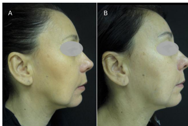
Figure 4: Before (a) and after (b) intralesional Nd: YAG laser therapy of PMMA-induced nodule on the mandibular margin

Usually, the endpoint for the laser action is the temperature and mainly the resistance during cannula advancement in the fibrous tissue. The product of the laser action is removed using the negative pressure of around 450 mm Hg in conjunction with suction using a blunt liposuction cannula of 2.0-2.5 mm of diameter. The quantity of material removed from the patient varies according to each situation (Figure 3). The procedure lasts from 30 minutes to 3 hours.