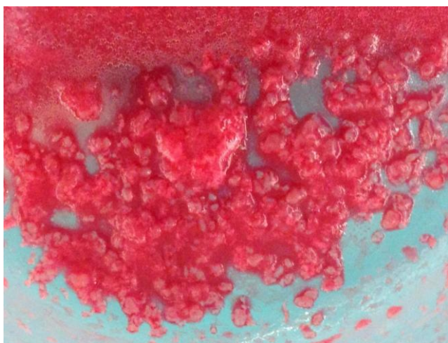
Figure 3: a Typical aspect of aspirated PMMA material after laser action

The cannula is moved intralesional within the tissue. The external skin temperature is controlled using a digital thermometer. The upper limit of skin temperature is 42° Celsius to avoid a potential skin burn. In some subjects, a thermal camera was used at the same time as the laser action, which provides an accurate and instantaneously skin and tissue temperature control. Cold compresses were applied in the treated laser region to maintain skin integrity and avoid skin damage. Laser treatment is delivered over a variable length of time according to the amount of granuloma, facial or body location, previous treatments, external scar, internal fibrosis and resistance.