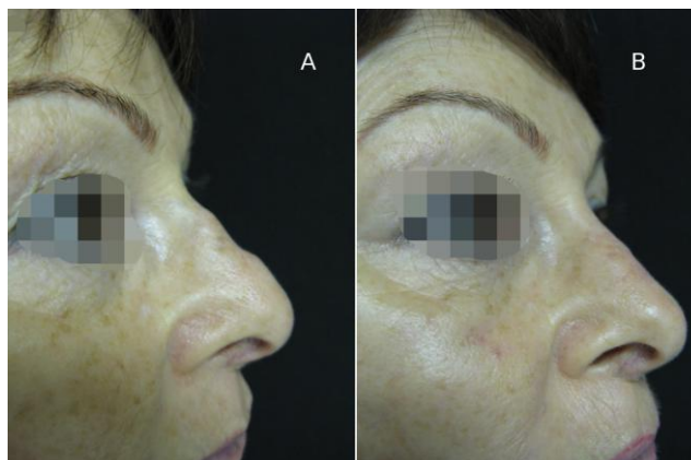
Figure 5: PMMA nodule of the nasal dorsum (a); After treatment with an intralesional laser (b)

We have observed patients with a very small quantity of PMMA in the face but severe complications. At the same time, patients with a larger quantity of injected PMMA in the chest/breasts had no inflammatory problems, foreign body granulomas or other clinical manifestations after long years. Probably there is no relationship between the amount of removed material using laser and the clinical improvement as well. Many patients with very small PMMA volume injections in the face had an impressive clinical and aesthetic improvement after laser therapy (Figures 4, 5 and 6).