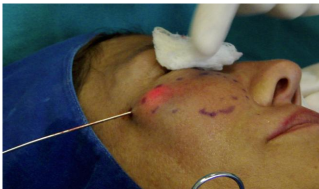
Figure 2: Granuloma in the malar region due to PMMA injection. Treatment by intralesional Nd: YAG laser

The laser energy is delivered to the affected tissue through a 300-600-micron fibre optic, embedded in a 1 or 1.6 mm diameter stainless steel micro-cannula of variable length. The distal portion of the fibre optic is extended approximately 2 mm beyond the distal end of the cannula allowing the direct contact of the laser energy with the organic tissue and synthetic material/granuloma. The helium-neon (He: Ne) laser source is combined into the laser beam allowing a precise visualisation of the region where the energy is acting, due to cutaneous transillumination (Figure 2).