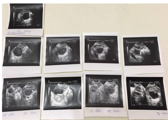
Figure 2: Ultrasound image report after the treatment

Figure 2 is shown ultrasound image done after the treatment showing the cysts are gone from both ovaries.