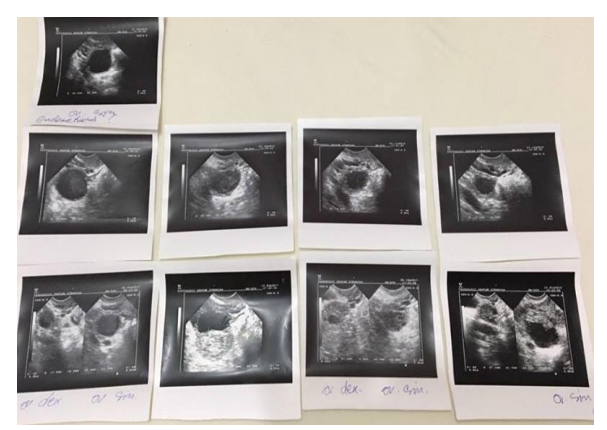
Figure 2: Ultrasound image report after the treatment

Figure 2 is shown ultrasound image done after the treatment showing the cysts are gone from both ovaries.