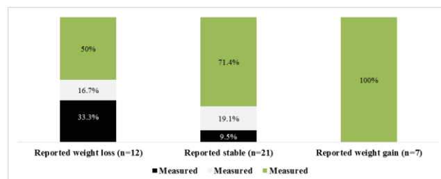
Figure 1: Weight change: Reported and actual

Overall agreement between reported and measured weight change among the participants was fair (weighted Kappa = 0.21; 95% CI: 0.05 to 0.38). The discrepancy between actual and perceived weight gain was highest among two subgroups of students which were the ones who perceived they lost weight (yet 50% had gained weight) and the ones who perceived they had maintained weight (yet 71.4% had gained weight). The only subgroup of students who had perceived weight change which was by actual weight change were the ones who had reported weight gain (Figure 1).