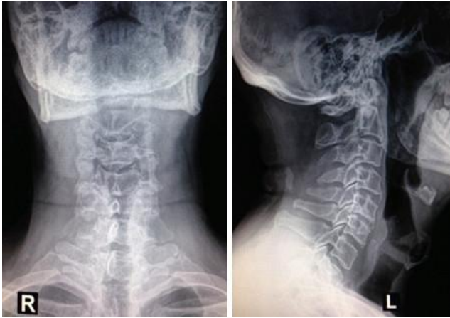
Figure 6: Cervical X-Ray in 3-year follow up

Papillary thyroid carcinoma represented the most common type of thyroid cancer (83%) [4]. Mutations occurred in papillary thyroid carcinoma were BRAF/RAS, RET/PTC, PIK3CA, TP53, TSHR, PTEN, GNAS, and CTNNB1 [5]. The most aggressive behaviours were gene mutation of BRAF V600E, a part of MAP kinase cascade, which promotes proto-oncogenes [6]. Besides that, it also caused dysfunction of iodine absorption of follicular cells, blunted the radioiodine therapy [7].