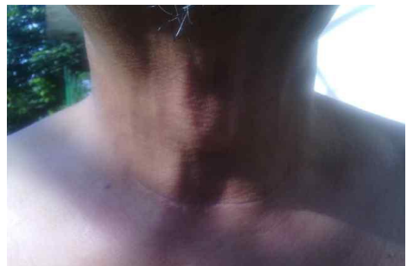
Figure 5: Surgical outcome cosmetically was good

Surgical outcome regarding preservation of nervous and parathyroid glands as well as the cosmetic aspect was good (Figure 5). During 3-year follow-up, evidence of tumour recurrence and complication was not found (Figure 6).