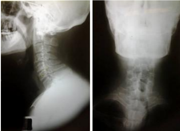
Figure 1: Cervical x-ray showed inferolateral tracheal deviation

metastases lesion was found on chest x-ray examination. Laboratory examination revealed a normal level of thyroid hormone. FNA biopsy showed a follicular neoplasm of the thyroid.