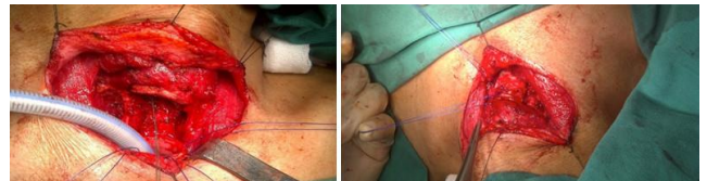
Figure 4: Sleeve resection with end-to-end anastomosis

Pathology report revealed papillary thyroid carcinoma with tracheal invasion, with a clear margin of the edge of tracheal resection. After resection, the patient was positioned with a fully flexed head (chin to chest position) for about 3 weeks, the orotracheal tube placed for 4 days as the stent, and a nasogastric tube placed for 7 days for feeding. The postoperative condition was uneventful, and the patient recovered satisfactorily.