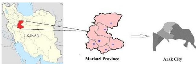
Figure 1: Geographic Location of Arak city in Iran

Forty-eight soil samples were collected from Arak, capital of Markazi Province, located on the crossroad of northern, eastern, southern, and western provinces of Iran (Arak, Iran; 34°00' N 49°40' E; Figure 1). Because of the presence of various industries, this city has many immigrants. In this study, the soil of parks and gardens were collected for analysis. For this purpose, approximately 50 g of soil was collected in sterile bags and transferred to the Parasitology and Mycology Laboratory, Arak University of Medical Sciences.