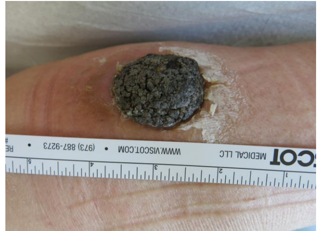
Figure 6: Irritated seborrheic keratosis resembling cutaneous squamous cell carcinoma

present. In clinical practice, it is important to separate irritated SK from cutaneous squamous cell carcinoma (SCC) (Figure 6). Immunohistochemistry may be helpful to distinguish both entities. In a recent study, the combination of U3 small nucleolar ribonucleoprotein protein IMP3 and B-cell lymphoma 2 regulatory protein (BCL-2) may have been shown diagnostic utility in distinguishing between irritated SK and SCC in daily clinical practice while epidermal growth factor receptor (EGFR) immunohistochemistry did not appear to be useful in this setting [12].