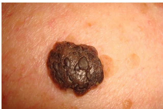
Figure 7: Melanoakanthoma with prominent horn cysts

This is the hyperpigmented acanthotic type with a proliferation of basaloid cells with mild or even absent hyperkeratosis. Numerous melanocytes are intermingled. Melanophages are located within the dermis underneath a tumour (Fig. 7) [1].