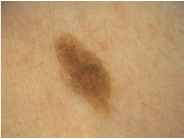
Figure 4: Reticular seborrheic keratosis with an oak-leave appearance