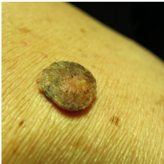
Figure 1: Hyperkeratotic seborrheic keratosis

The histologic feature of this common subtype is orthohyperkeratosis with papillomatosis. Acanthosis is mild or absent. Horn pearls are missing (Figure 1) [1].