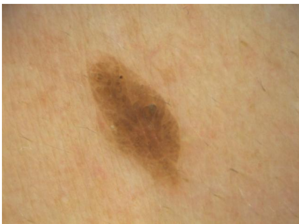
Figure 4: Reticular seborrheic keratosis with an oak-leaf appearance