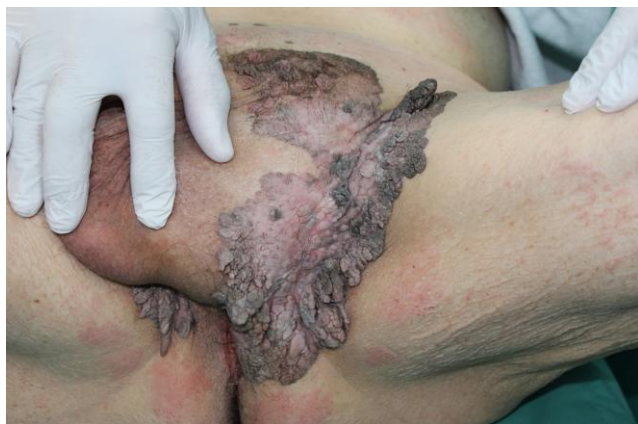
Figure 5: Giant hyperpigmented clonal seborrheic keratosis resembling Buschke-Löwenstein a tumour

In this type marked acanthosis and papillomatosis are associated with orthohyperkeratosis. Tumour cells are spindle-shaped. With a tumour demarcated tumour, islands of basaloid cell nests are found. Major differential diagnosis to clonal SK is pagetoid Bowen's disease (Figure 5). Immunohistochemistry may be helpful in selected cases to distinguish both entities. Cytokeratin-10 is more expressed in clonal SK, while increased Ki-67-positive cells and the presence of > 75% positive p16 cells is in favour of pagetoid Bowen's disease [11].