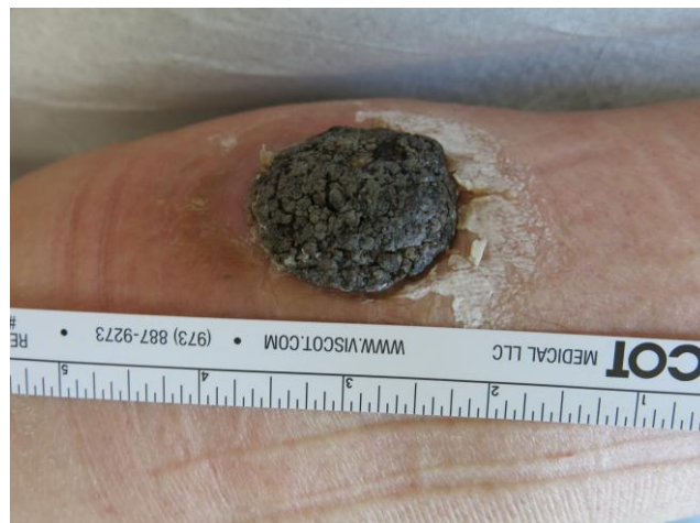
Figure 6: Irritated seborrheic keratosis resembling cutaneous squamous cell carcinoma

present. In clinical practice, it is important to separate irritated SK from cutaneous squamous cell carcinoma (SCC) (Figure 6). Immunohistochemistry may be helpful to distinguish both entities. In a recent study, the combination of U3 small nucleolar ribonucleoprotein protein IMP3 and B-cell lymphoma 2 regulatory protein (BCL-2) may have been shown diagnostic utility in distinguishing between irritated SK and SCC in daily clinical practice while epidermal growth factor receptor (EGFR) immunohistochemistry did not appear to be useful in this setting [12].