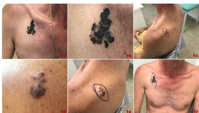
Figure 1: a), b) Clinical picture of primary cutaneous melanoma located on the right- subclavicular. Lesion with uneven pigmentation and uneven boundaries; c), d) Clinical view of melanoma showing uneven pigmentation, uneven edges and data about involution located in the left scapular area; e), f) Outlining the 0,5 cm operational security boundaries in all directions, preoperative finding

Clinically and dermatoscopically, these findings met the requirements for a malignant melanocytic lesion. Further tests were carried out: 1) paraclinical – without substantial changes, 2) lymph node ultrasound – no enlarged lymph nodes were visualized in the neck, two axil and inguinal area; 3) lung and heart radiology – preserved transparency of pulmonary parenchyma without active disease alterations – no focal changes were observed; clear costophrenic sinuses; heart shadow – normal, 4) S-100-0.036 ( < 0.1 ); LDH – 314.00 IU (240.00-480.00).