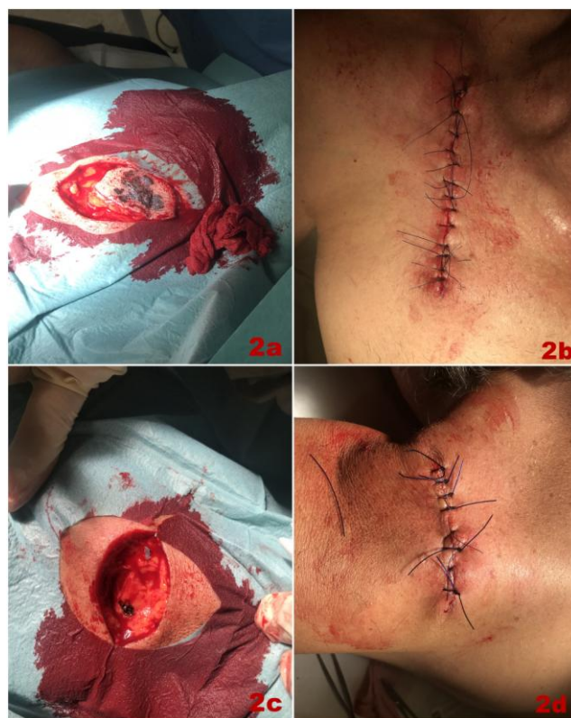
Figure 2: a), c) Intraoperative finding of the two lesions removed by elliptical excision; b), d) Postoperative clinical picture of surgical defects closed by single interrupted sutures

In the left scapular area, a primary excision of the melanocytic lesion was performed with a surgical safety margin of 0.5 cm in all directions (Figure 2c). The defect was corrected using stretch plastics (Figure 2d). The histological examination of the lesion removed from the left scapular area showed superficially advancing malignant melanoma, Clark's level II, Breslow's thickness 1 mm, no ulceration, T1bN0M0 stage.