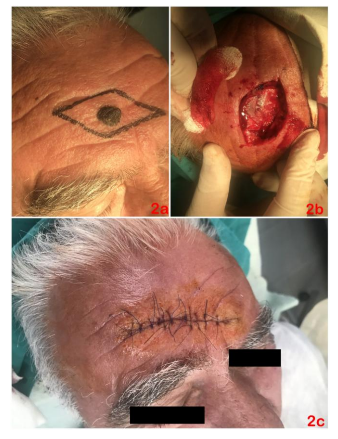
Figure 2: a) Outlining the 0,5 cm operational security boundaries in all directions, preoperative finding; b) Intraoperative finding of the lesion removed by elliptical excision; c) Postoperative clinical picture of surgical defect closed by single interrupted sutures

During the dermatological examination in the forehead area, the presence of a dark brown to the black melanocytic lesion, a nodular component, and an eroded surface was found (Figure 2a).