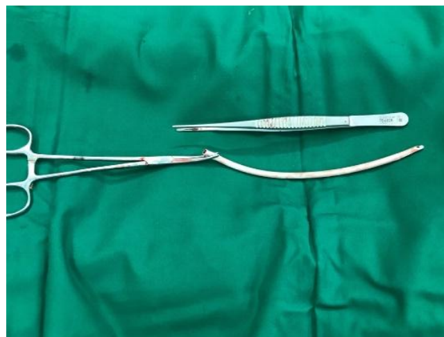
Figure 3: Foreign body of a fractured fragment of double lumen catheter after retrieval

After the procedure, the patient was monitored, electrocardiogram and examination were normal. There were not any major or minor complications such as arrhythmia, bleeding, vascular or cardiac perforation or local hematoma were observed during or after the procedure.