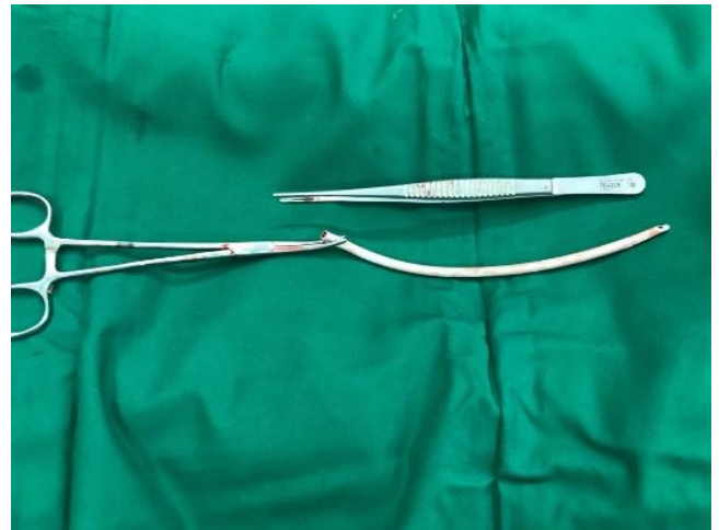
Figure 3: Foreign body of a fractured fragment of double lumen catheter after retrieval

After the procedure, the patient was monitored, electrocardiogram and examination were normal. There were not any major or minor complications such as arrhythmia, bleeding, vascular or cardiac perforation or local hematoma were observed during or after the procedure.