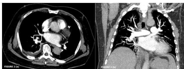
Figure 2: a) Computed Tomography of Pulmonary Angiography (CTPA) Axial view of the thorax showing pulmonary embolus effecting the secondary branch of descending right pulmonary artery. The partial central filling defect surrounded by contrast material produces polo mint sign, in keeping with acute embolus; b) CTPA Coronal view of the thorax shows filling defect of the right basal trunk with no extension into the right lower lobe segmental branch

Given the atypical presentation of pneumonia and high suspicion of pulmonary embolism, the respiratory physician was referred to review the patient. Although Well's score was only 1.5 which was low, given the risk of partial immobilisation for a few days before referral and also having persistent type 1 respiratory failure despite on oxygen supplementation, he was subjected to Computed Tomographic Pulmonary Angiography scan. The scan showed impaired filling over the secondary branch of the descending right pulmonary artery (as shown in Figure 2a and 2b), in keeping with the diagnosis of pulmonary embolism. There was also right-sided pleural effusion and collapsed consolidation over the ipsilateral posterobasal segment of the lower lobe.