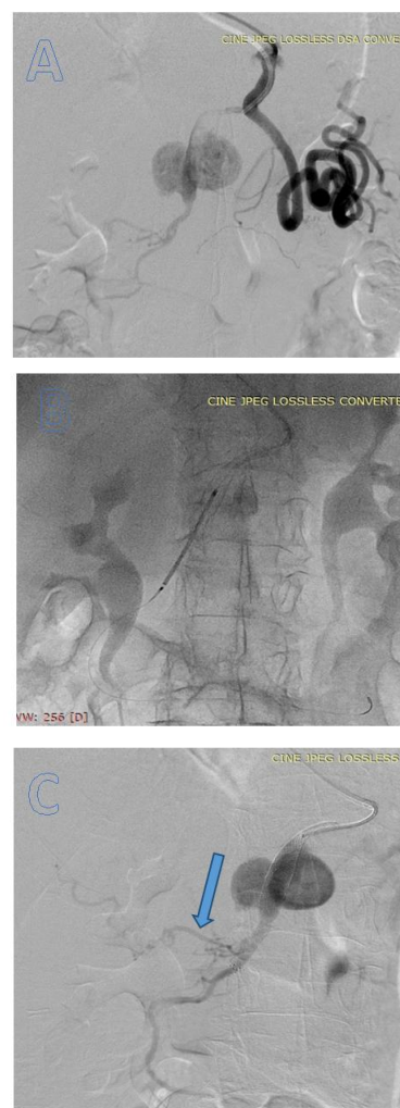
Figure 2: Angiographic findings and treatment. A) Celiac trunk arteriography in 30° left anterior oblique projection shows the aneurysm at the distal site of common hepatic artery; B) Guidewire placed deeply in GDA and 2 carotid stents placed along the neck with complete overstenting; C) Poststenting angiography shows patency of both stents and reduced flow in the aneurysmal sac, patent proper hepatic artery with distal origin (arrow)

The aneurysm was approximately 70 mm in its largest diameter with the very big active portion of 50 mm, mural thrombosis and ill-defined borders which can be a radiological sign of pseudoaneurysm. Also, the neck of the aneurysm was very wide.