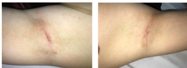
Figure 2: The scar in both side of patient's axillae 6 months postoperatively

The ugly scar is also a problem that causes patients' anxiety after surgery. In our group of patients, there was a predominance of flat scars (72.6%), followed by hypertrophic scars (24.2%), with only one axilla with contractive scars (Figure 2). During the followed period, we found a phenomenon that the scars in the right axillary fossa were more conspicuous than those in the left side. This may be attributed to the increased strains in the right side due to relatively more movements. The case of contractive scars occurred on a patient with hematoma, but the contractive degree was slight and acceptable.