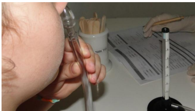
Figure 2: Measuring nasal air emission using the See-Scape instrument

The See-Scape instrument is used for instrumental examination [15] of nasal air emission in speech. The examination is indirect, non-invasive and simple to conduct. In addition to the clear visual representation, the instrument gives the opportunity to objectively measure the nasal air emission of the patient during the speech. Measuring nasal air emission using the See-Scape instrument (Figure 2) begins by inserting the nasal tip in one of the patient's nostrils.