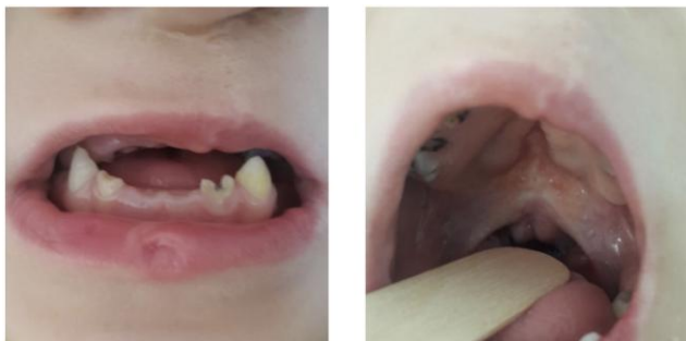
Figure 1: Establishing the existence of cleft lip and palate

Class IV – The cleft is bilateral cleft lip and palate.