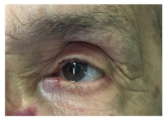
Figure 4: Complete resolution after surgical treatment

The operation, performed at the eye clinic (May 2018), and the subsequent histological examination confirmed KS. Currently, the patient practices cycles of liposomal doxorubicin, finding a containment of the manifestations. After six months, there are no other ocular manifestations (Figure 4).