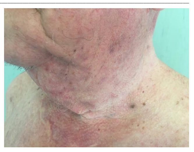
Figure 2: Clinical improvement with reduction/absence of nodules dimension

These findings were consistent with Kaposi Sarcoma diagnosis, nodular stage. Laboratory investigations showed HIV test negativity (antibodies anti HIV1/2-antigen p24), White Blood Cells 10.57 x 10<sup>3</sup>/uL (normal range 4.8-10.8), Red Blood Cells 4.16 \times 10^6/\text{uL} (4.2-5.6), Platelets 234 x 10<sup>3</sup>/uL (130-400); Hb 15 g/dL (12-17.5), liver function [ALT 21 U/L (0 -55); AST 22 U/L (0 - 34)] and renal function [creatinine 0.7 mg/dL (0.7-1.2)] tests within the normal limit. Chest X-ray, abdominal and lymph node ultrasound and low gastrointestinal endoscopy were normal. Faecal occult blood test and videolaryngoscopy were performed, and no abnormalities were documented. Considering widespread skin involvement (> 25 lesions) and oral lesions, he was put on monthly chemotherapy with vinblastine dose of 10 mg. White blood count was normal, and patientreported only nausea. The clinical examination nine months after starting therapy showed clinical improvement with reduction of nodules dimension (Figure 2). After one year, no recurrence was observed.