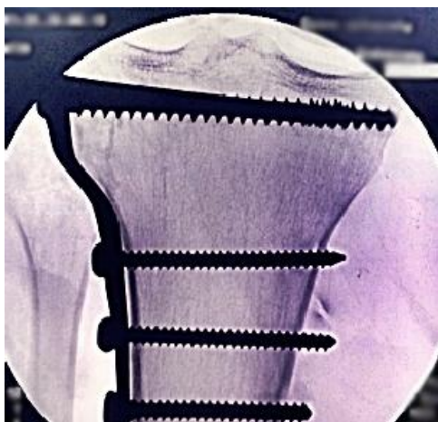
Figure 5: Intraoperative photo from the image intensifier after fracture reduction and fixation by plate and screws

While, in the presence of a comminuted articular surface, or unstable fracture pattern, plate and screws were used for fixation as this added more stability (Figure 5). They were inserted using minimal skin incisions. Iliac crest graft was used in 21 cases.