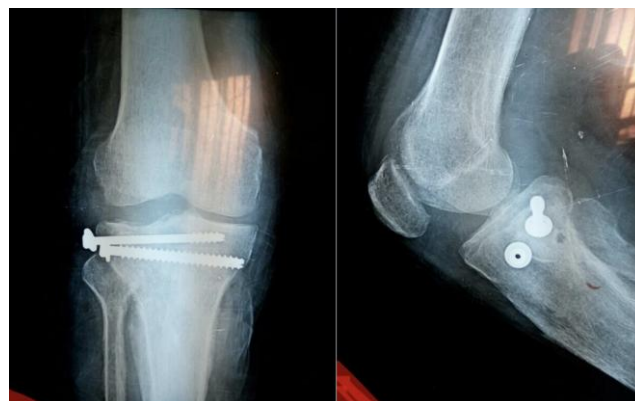
Figure 6: Xrays (anteroposterior and lateral views) after 1 year

This was checked both clinically and radiologically. Clinically, the patient was examined for the absence of tenderness at the fracture site and during weight bearing. Radiologically, the x-rays were checked for the continuity of the cortical bone and absence of defects in the fracture site (Figure 6).