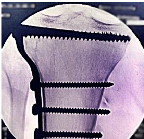
Figure 5: Intraoperative photo from the image intensifier after fracture reduction and fixation by plate and screws

While, in the presence of a comminuted articular surface, or unstable fracture pattern, plate and screws were used for fixation as this added more stability (Figure 5). They were inserted using minimal skin incisions. Iliac crest graft was used in 21 cases.