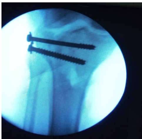
Figure 4: Intraoperative photo from the image intensifier after fracture reduction and fixation by 2 screws

Final fixation of the fracture was done in 2 ways. Cannulated screws were used in cases with no comminution or when the fracture pattern was relatively stable after reduction (Figure 4).