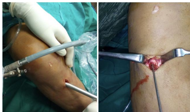
Figure 2: the window was created around the K-wire using the mosaicplasty set

The position of the wire was checked using the arthroscope and the image intensifier. After that, a window was created around the K-wire using the mosaicplasty set (Figure 2).