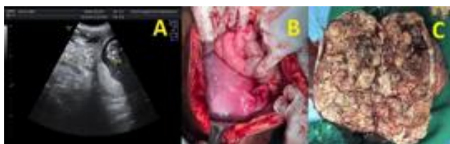
Figure 1: Immature Teratoma Ultrasound (US) and Macroscopic Finding Durante Operation. CASE 1: A. US showed hypohyperechoic left adnexal mass which cannot reach totally inside probe range at 19w5d GA, irregular border, unsmooth surface; B. uterine size appropriate with 18-20 weeks GA, left Fallopian tube was normal, post-oophorectomy; and C. Lobulated solid mass with internal multiseptal cystic mass

A 31 y.o. Multigravida (G2P1A0) at 8 weeks 1 day (8w1d) single/life gestation with solid ovarian tumour referred by the obstetrician to Obstetric and Gynecologic Policlinic of Sanglah Hospital, Denpasar. The pelvic examination found an adnexal tumour which increased progressively in size from 15 x 15 cm at 8w1d gestational age (GA) to 30 x 30cm at 19w5d GA, which was solid, with an irregular surface, mobile, and painful. Tumor marker levels were raised, AFP: 699.9 IU/mL (normal level at 2 nd trimester: 22-93 IU/mL), CA-125: 285.4 U/mL (normal level at 2 nd trimester: < 35 U/mL), LDH: 579 U/L (normal level at 2 nd trimester: 240-480). The patient had primary surgery (left oophorectomy, cytological test, and omentectomy) at 19w5d GA with minimal manipulation of the uterus. A midline abdominal incision performed, and an operation, a unilateral solid ovarian tumour identified 40 x 40cm in size with an irregular surface, arising from the left ovary with omental adhesions requiring adhesiolysis despite rupture of the tumour, it was successfully removed (Figure 1).