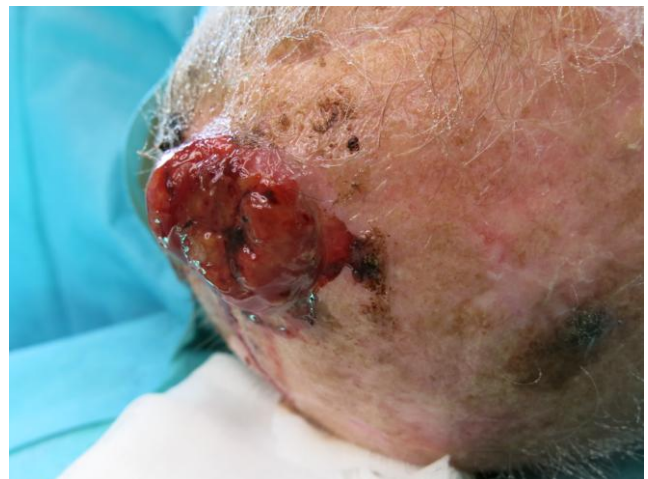
Figure 2: Dermal pleomorphic sarcoma (Case 2)

His facial and neck skin demonstrated signs of extrinsic ageing with cutis rhomboidalis nuchae, facial telangiectasias, multiple actinic keratoses and elastosis. On examination, we observed a partially ulcerated skin tumour in the left parieto-occipital region, measuring 4 x 4 cm (Figure 2).