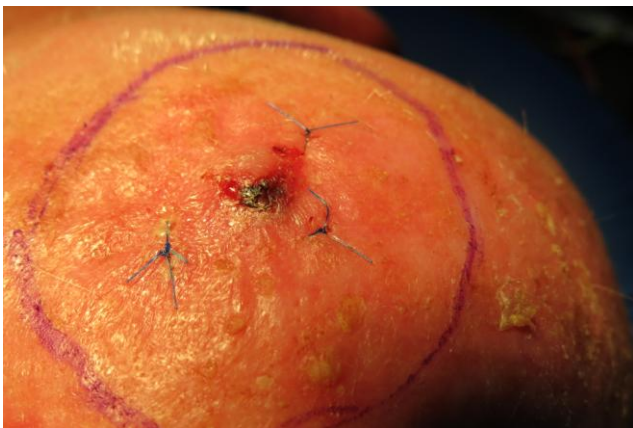
Figure 1: Dermal pleomorphic sarcoma (Case 1)

On examination, we observed numerous actinic keratoses on his baldness, cutis rhomboidalis nuchae and elastosis. In the centre of the occipital region, a nodular firm, a painless, skin-coloured, ill-defined plaque was observed with a diameter of approximately 1.5 cm (Figure 1).