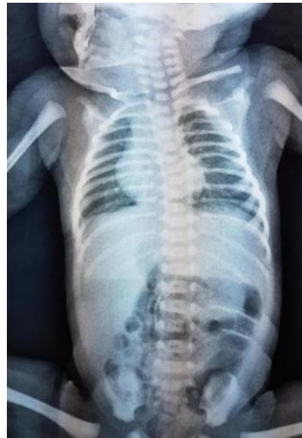
Figure 3: Radiological examination of the anteroposterior spine. No abnormalities were found

IgG anti-HSV (herpes simplex virus) 1. From the physical examination and supporting data, it was concluded that Goldenhar syndrome.