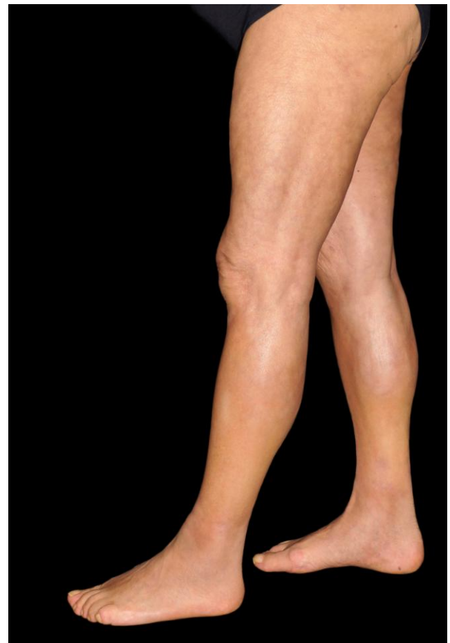
Figure 3: Eosinophilic fasciitis in a 73-year-old woman. Peau d'orange sign

On examination, we observed symmetrical plaque-like subcutaneous indurations on lower arms and lower legs. There was a peau d'orange appearance of her upper legs (Figure 3). Hands and feet remained unaffected. She had no Raynaud's phenomenon.