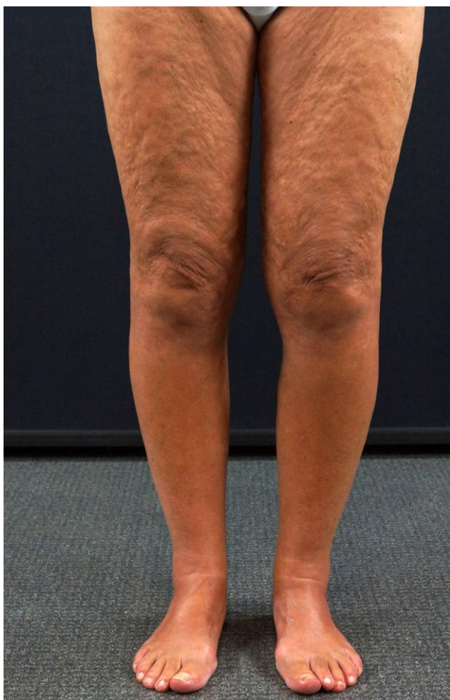
Figure 2: Eosinophilic fasciitis in a 64-year-old woman. Peau d'orange sign

abdomen: Steatosis hepatitis, liver hemangioma. MRI right lower arm: Hyperintense fascial signals. Mammography: Involution. No malignancy.