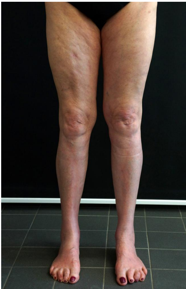
Figure 1: Eosinophilic fasciitis in a 65-year-old woman. Positive groove sign on her leg

On examination, we observed symmetric brownish hyperpigmentation on lower legs and lower arms, and the lower trunk. The skin appeared thickened, and it was impossible to crease the skin. The groove sign was positive on the legs (Figure 1). She had no Raynaud's phenomenon.