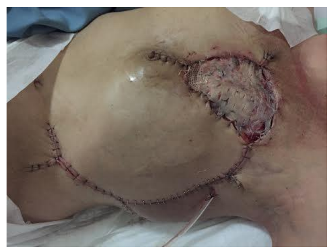
Figure 4: The defect was covered by TA flap and split-thickness skin graft on the medial side

Laboratory findings result in anaemia and hypoalbuminemia. We decided to perform palliative radical mastectomy to improve quality of life. Primary skin closure was not possible due to the wide defect of skin and soft tissue (Figure 3).