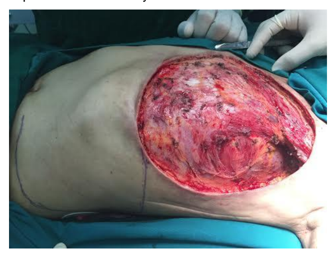
Figure 3: Wide defect of skin and soft tissue after radical mastectomy

Enlargement of the left lymph node was apparent and multiple. So, based on TNM staging, she diagnosed stage IV breast cancer (T4bN2M1). She continued with Docetaxel 65 mg/m<sup>2</sup> + Capecitabine about 2 cycles.