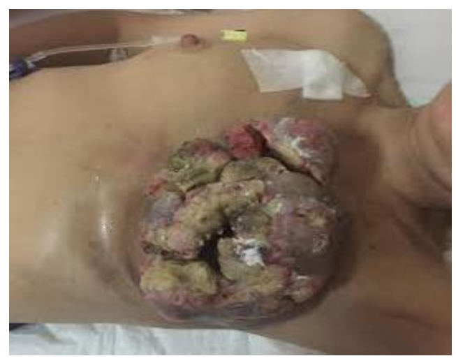
Figure 2: Lump with no response after 6 cycles of chemotherapy

Patients had history 4 cycles of chemotherapy (Adriamycin + Cyclophosphamide 2 cycles and switched to Docetaxel 40 mg/m² + Capecitabine 2000 mg/m² per day, 1-14 days about 2 cycles). There was no response to chemotherapy but follow up on the chest and abdominal CT scan, no fluid in the lung, and no metastatic on the liver. Laboratory finding was within normal limit. The patient then continued her treatment at the place residence in Bali.