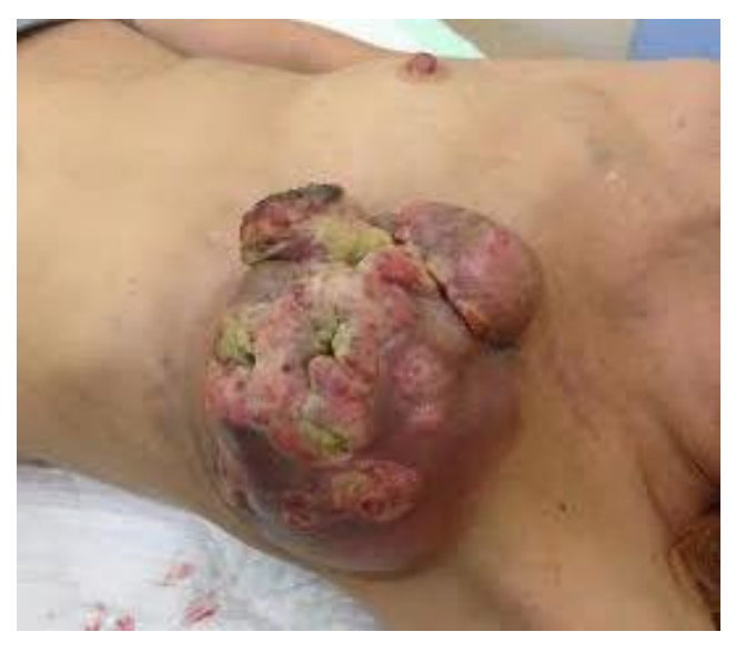
Figure 1: Lump with an ulcer on the left breast

or treated. On 2014, lump getting bigger and patient lost 7 kg during a month. She was hospitalised in Moscow for follow up examination. CT scan showed a mass in the left breast, lymph node enlargement on the left axilla, and pleural effusion on the left lung. The core biopsy revealed as low-differentiated breast cancer, luminal type-B. MRI brain showed no metastasis.