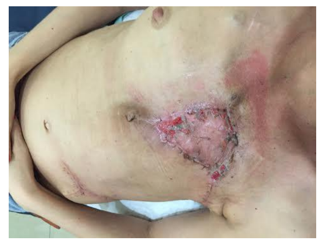
Figure 6: Wound healing after three weeks of operation

The TA flap was viable, and there was no complication (Figure 6). The wound was well healed after two months of the operation (Figure 7).