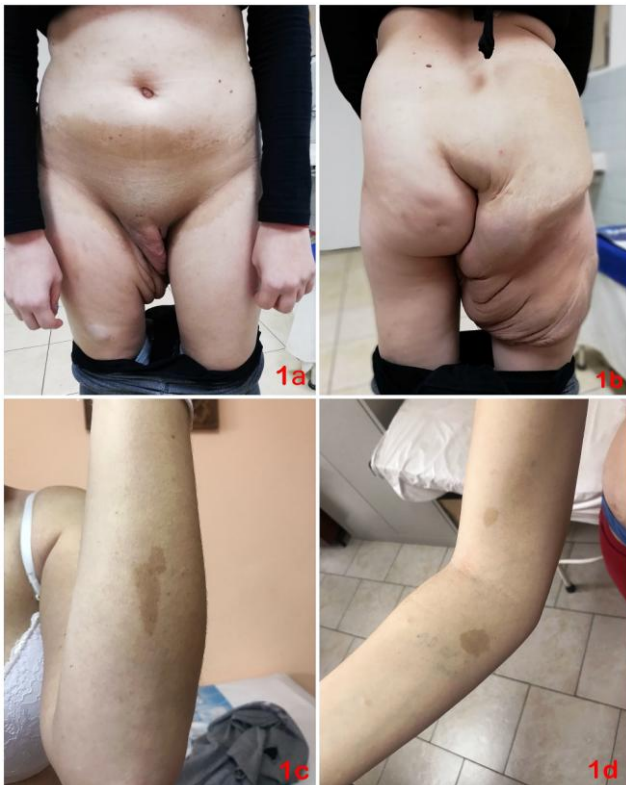
Figure 1: A), B) Clinical examination: in the area of the genitals, the gluteal region and the upper medial part of the right hip, a plexiform tumour-like formation with a darker-skin-colour appearance, which resembles clinically as "worm bag" (Figures 1a and 1b) was observed; C), D): Clinical view of numerous café-au-lait spots on the skin of the upper limbs

We present a 25-year-old woman with a family history for neurofibromatosis type 1. According to anamnestic data, father and grandmother suffer from neurofibromatosis type 1, as in the grandmother being observed lethal outcome as a result of the transition from plexiform neurofibroma to neurofibrosarcoma in the neck area. The first symptoms date back to the age of 2-3 when multiple café-au-lait spots were observed all over the body and appearance of tumour formation in the neck and genital area (Figures 1a-1d). At the age of 3 labiaplasties were performed on the pubic lips. By entering puberty, tumour formations in the neck area and genitals begin to increase in size. In 2015, the patient was hospitalised in a plastic-restorative and aesthetic surgery department, where step by step the skin and some parts of the plexiform neurofibromas in the lumbosacral, the sciatic, genital, and upper-medial area of the right thigh have been removed.