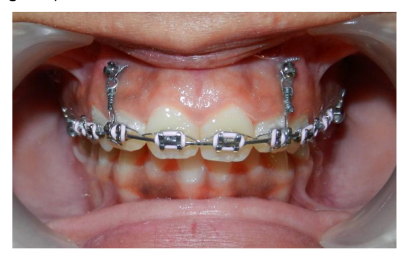
Figure 1: Maxillary incisors intrusion using mini-screws (start of treatment)

In group1 intrusion of maxillary incisors was done using two miniscrews (Jeil medical Co., Seoul, Korea), 1.4 mm in diameter and 6 mm in length. The miniscrews were placed at the mucogingival junction distal to the maxillary lateral incisors. The miniscrews were loaded 2 weeks later with medium super-elastic nickel-titanium closed-coil springs (3M UnitekTM TAD constant force coil spring 3 mm medium force). A force of 100g was measured using a calibrated Dontrix gauge (Correx; Ortho Care, Saltaire, United Kingdom).