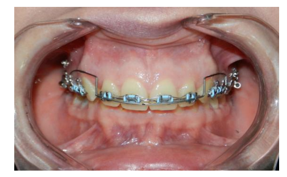
Figure 2: Maxillary incisor intrusion using the intrusive arch (start of treatment)

In group 2 intrusion of upper incisors was done using an intrusive arch that was fabricated using 0.017" x 0.025" TMA (Ormco) wire and placed in the auxiliary slot of the maxillary bands. It was activated with a Tweed loop plier (Pin Tech Instruments, Sialkot, Pakistan) to produce an intrusive force of 100 g as applied and measured using the same force gauge.