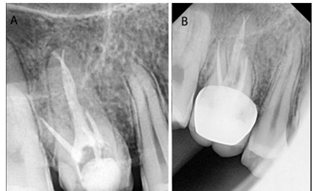
Figure 3: After the procedure; A) Immediate-postoperative image; B) 6-months-follow-up radiograph

After 6 months of following up, the tooth #16 was asymptomatic as well as complete healing was shown on the radiograph (Figure 3B).