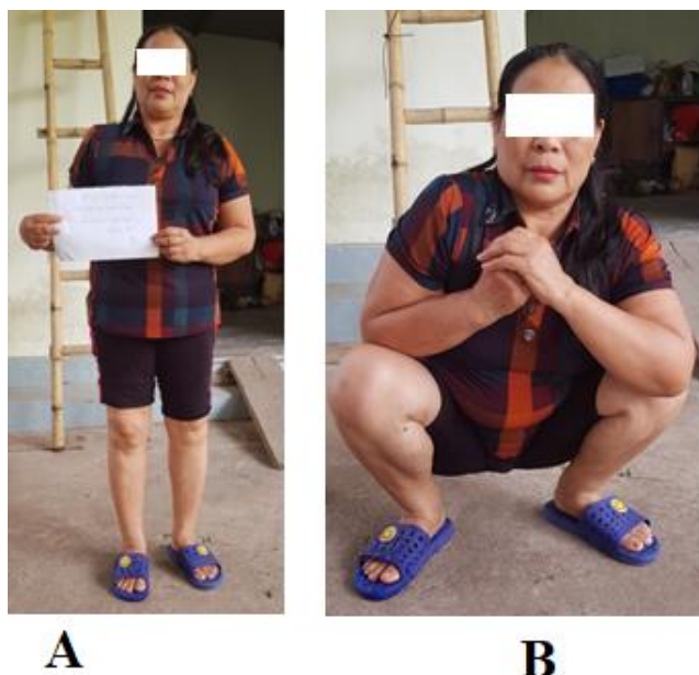
Figure 3: Knee function after 18 months of surgery; A) Extending knee posture; B. Flexing knee posture