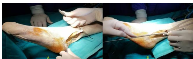
Figure 1: Skin incision to approach AHPLT tendon A) and Tendon stripping B)