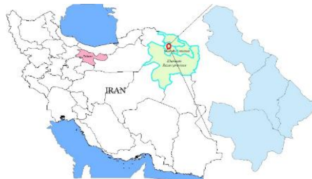
Figure 1: Geographical location of Neyshabur county, Khorasan Razavi province, East Iran

Neyshabur County is a city in the central part of Razavi Khorasan and is located between 58° 19' and 59° 30' longitude and 35° 40' to 36° and 39' latitude in the eastern margin of the central desert of Iran [22]. The vast majority of this city is located in a relatively large plain that is limited to Chenaran and Quchan counties from the north (by the Binalud Mountains); Mashhad County from the east; Torbat Heydariyeh and Kashmar from the south; Sabzevar from the west; and Farooj County from the northwest in North Khorasan province. Neyshabur is located 110 kilometres west of Mashhad (Center of the Khorasan Razavi province) and 768 kilometres east of Tehran (Capital of Iran). The size of Neyshabur county is 8,722 square kilometres, which is equal to 2.9 percent of the area of Khorasan and 53 percent of the total area of Iran. Due to the population of Neyshabur with 451,780 people in the last census in 2016, it is the second-most populous city in Khorasan Razavi province [23].