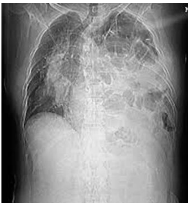
Figure 2: Chest radiography: complete opacity of the left thorax

A 60-year-old male patient was admitted to the emergency room with complaints of abdominal cramps, dysphagia, constipation, and shortness of breath. He had no record of thoracic or abdominal trauma, and his medical history was non-relevant. The psychosocial history of the patient as well as his family was normal. The patient had an arterial pressure of 90/60 mmHg, cardiac rate 120 b/min, and body temperature of 38°C. Laboratory analysis showed leukocytes is of 17 mm 3 /l and an elevated protein chain reaction (PCR). Blood Gas Analysis (BGA) showed PH 7.27, PCO 2 50 mmHg, PO 2 70 mmHg, HCO 3 17, BE-7 mEq. Physical examination elicited diffuse abdominal pain with a positive Blumberg sign, suggesting peritonitis. Bowel sounds were audible on the left side of the chest. A chest Ray showed complete opacity of the left thorax (Figure 2).