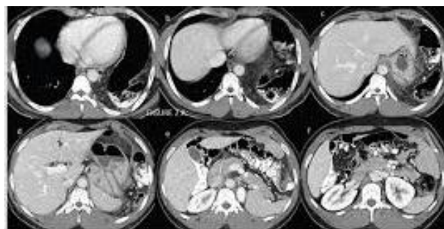
Fig.3 Computer Tomography (CT) Scan: images of a defect in the posterior left diaphragm and herniation of intra-abdominal fat and small bowel into the left hemithorax

Computer Tomography (CT) Scan showed a defect in the posterior left diaphragm and herniation of intra-abdominal fat and small bowel into the left hemithorax (Figure 3). BH was diagnosed based on the above findings. The surgery involved a laparoscopic approach. Reduction of the hernia sac and strangulated ischemic ileum was found. Ten cm of bowel was re-sectioned with lateral-lateral anastomosis. The patient was kept in the intensive care unit (ICU) for 10 days because of sepsis and acute respiratory distress syndrome (ARDS). He returned to the wards after 10 days and was discharged 19 days after surgery.